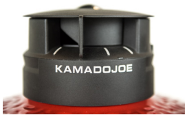
Kontrol Tower Top Vent