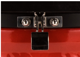
Stainless Steel Latch