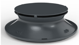
Patented Hyperbolic Insert