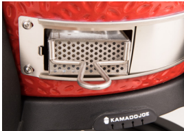
Patented Ash Collector