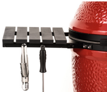
Aluminum Side Shelves