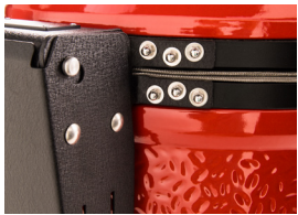
Air Lift Hinge